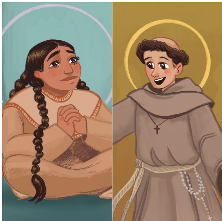
Photo credit: Saints Come in All Shapes and Sizes , Ascension Press

There is only one honor roll or hall of fame that matters: Heaven.