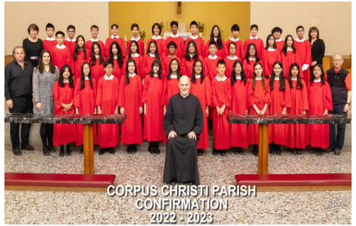
CORPUS CHRISTI PARISH CONFIRMATION 2022 - 2023